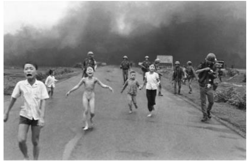
Figure 6. Children Fleeing a Napalm Strike, (Nick Ut, 1972)

Another striking photograph that demonstrates that photographs need the correct atmosphere of politics at times of crisis and wars to draw the public's attention is Huynh Cong (Nick) Ut's Children Fleeing a Napalm Strike , captured on June 8, 1972 towards the end of the decade-long Vietnam War when a powerful anti-war movement was already widespread among American public.